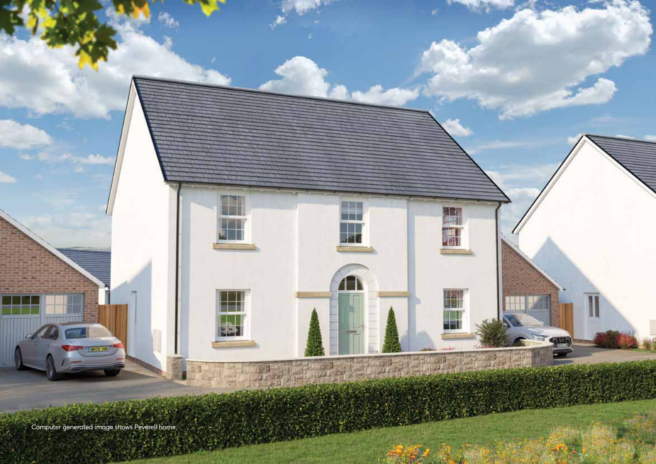
Computer generated image shows Peverell home